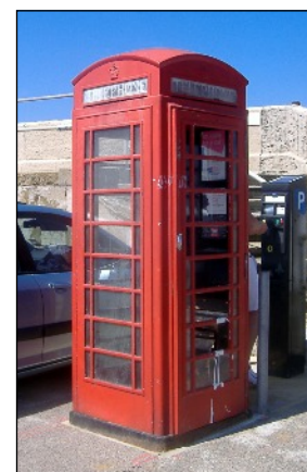
In its new location on the Stone Pier 2nd June 2010

The three photographs above show the K6 in its original location in Norfolk Road, Cliftonville