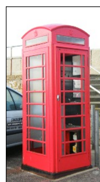
2nd March 2011