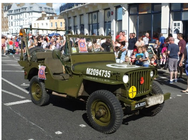
This WWII American Jeep added interest to the parade

A large number of spectators lined the route of this year's carnival parade from Palm Bay to Royal Esplanade. This year's carnival was reported to be the largest in Kent: it had 84 floats compared with 68 last year and yet the growth in the number of floats was despite funding cuts of some 60 per cent. The parade was loud and colourful but the absence of any live bands in the parade was, for many in the crowds, disappointing. For some reason, the parade came to a halt in