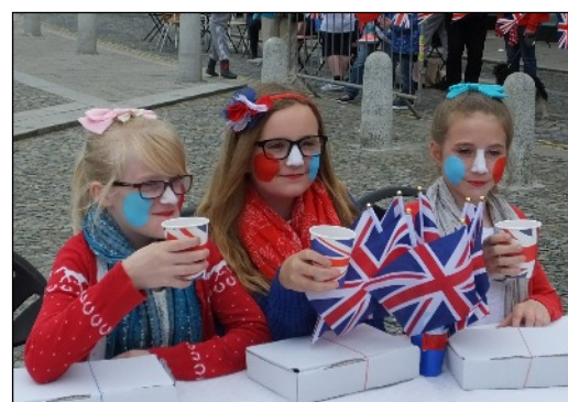
These three girls with their faces painted red, white and blue added colour to the occasion