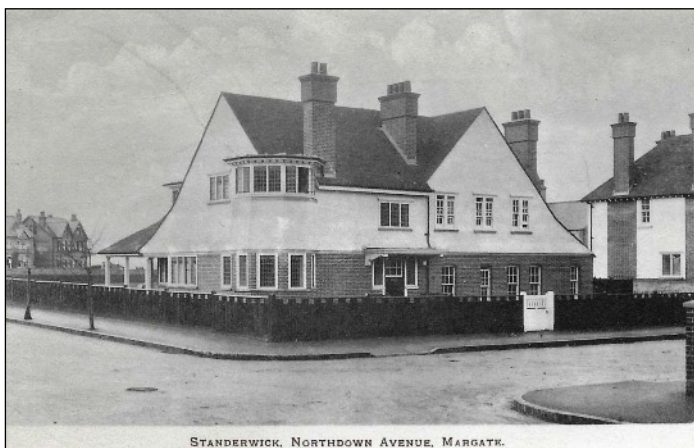
STANDERWICK, NORTHDOWN AVENUE, MARGATE.

One of Margate's fine Arts & Crafts houses which no longer exists. Can you identify its exact location?