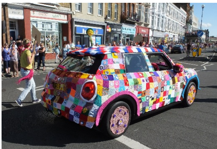
The Herne Bay Cozy Crew float which was awarded First Prize in the Best Decorated Vehicle class