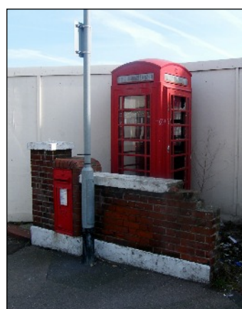
16th March 2010