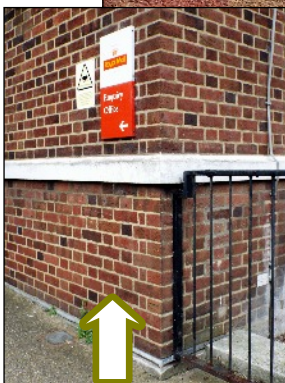
The cut benchmark on the side of the Royal Mail Collection Office on Addington Road