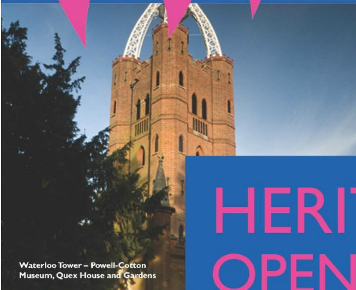
Waterloo Tower – Powell-Cotton Museum, Quex House and Gardens