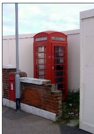
12th November 2008