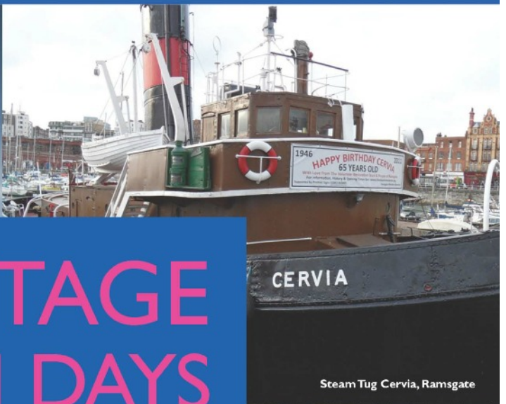
Steam Tug Cervia, Ramsgate