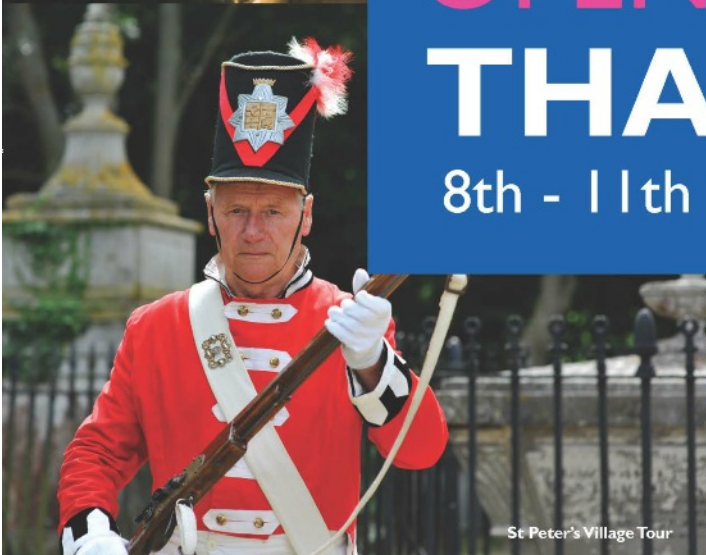
St Peter's Village Tour