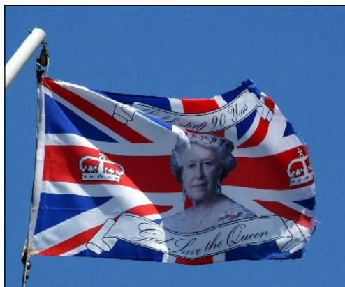
This special flag celebrating the Queen's 90th Birthday was flown during the occasion from the flagstaff at the Nayland Rock