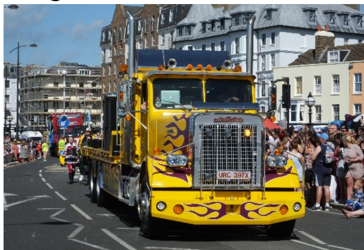
The procession was led by this monster of a truck to the delight of many spectators

A large number of spectators lined the route of this year's carnival parade from Palm Bay to Royal Esplanade. This year's carnival was reported to be the largest in Kent: it had 84 floats compared with 68 last year and yet the growth in the number of floats was despite funding cuts of some 60 per cent. The parade was loud and colourful but the absence of any live bands in the parade was, for many in the crowds, disappointing. For some reason, the parade came to a halt in