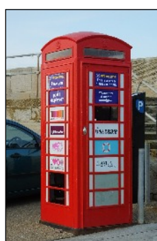
6th October 2013