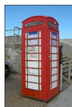
12th August 2016