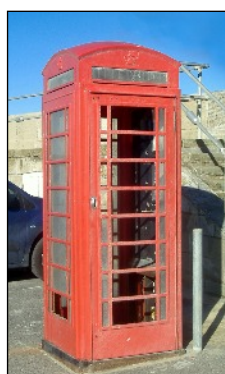
8th February 2011