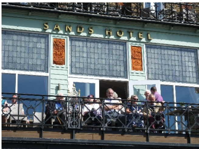
The Mayoral party enjoyed a grandstand view of the procession from the balcony of Sands Hotel