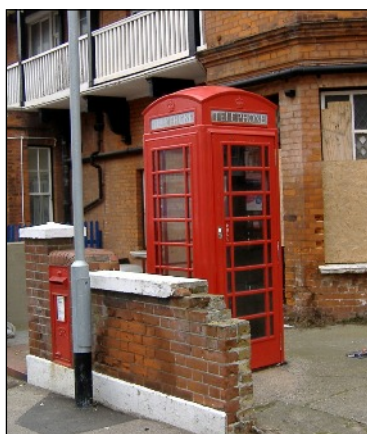
7th March 2006