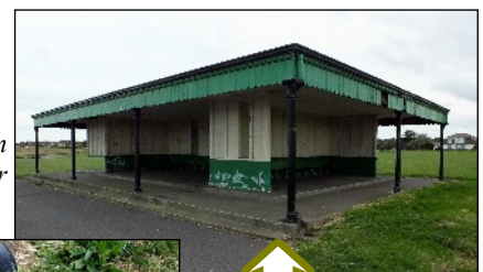
The rivet benchmark on Palm Bay Public Shelter