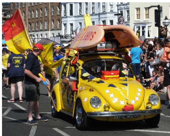
This Lifeguards decorated vintage VW Beetle float proved popular with the crowds