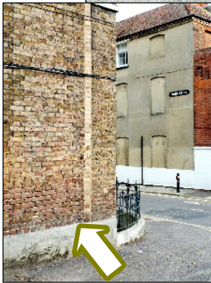
The cut benchmark on the side of the building at the corner of Addington Street and Hawley Square