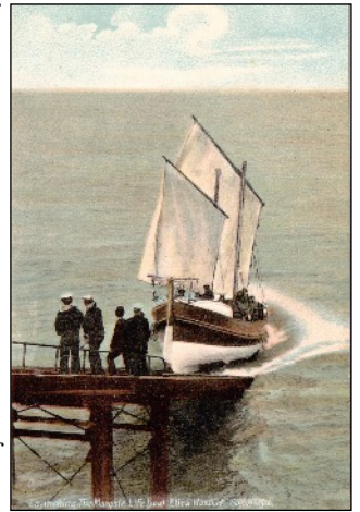
The former Margate Lifeboat 'Eliza Harriet'