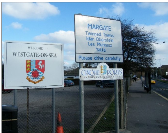
The photograph shows the location of all three signs that stood just inside the Westgate & Birchington Golf Club's car park at the junction of Canterbury Road and Domneva Road. The photograph was taken prior to May 2016