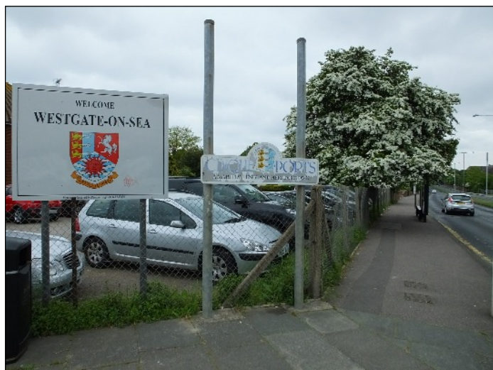
This photograph - taken in May 2016 - shows the removal of the large Margate sign but with the Cinque Ports sign still in place