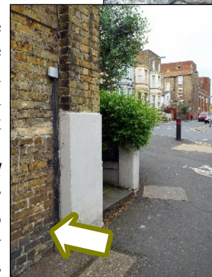
The cut benchmark on the side of the building at the corner of Victoria Road and Thanet Road