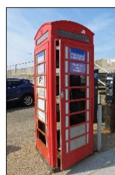
8th June 2016