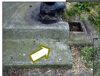
Close-up of rivet benchmark also showing an incised the arrow mark