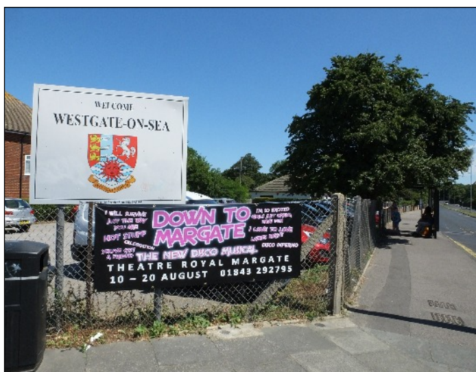
This photograph - taken in July 2016 - shows that the two scaffolding poles along with the Cinque Ports sign were removed subsequent to the taking of the second photo on this page. This photo also shows the 'Down to Margate' poster considered by some to be ungentle and unsuitable for Westgate-on-Sea

These three signs standing just inside the Westgate & Birchington Golf Club's car park on Canterbury Road have featured a number of times in our Newsletter. The two signs on the right seen in the first paragraph probably date from the late-1960s/early-70s and almost certainly pre-date the reorganisation of local government in 1974 when Thanet District Council was created. The Westgate sign seen on the left was put up by the Westgate & Westbrook Residents' Association some six years ago. The coat-of-arms design used on the Westgate sign was a creation of the crested china manufacturers in the early-1900s and was used by a number of Westgate organisations and clubs since that time on their stationery and publications.