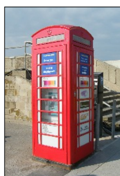
16th April 2011