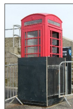
12th March 2011