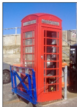
10th October 2010