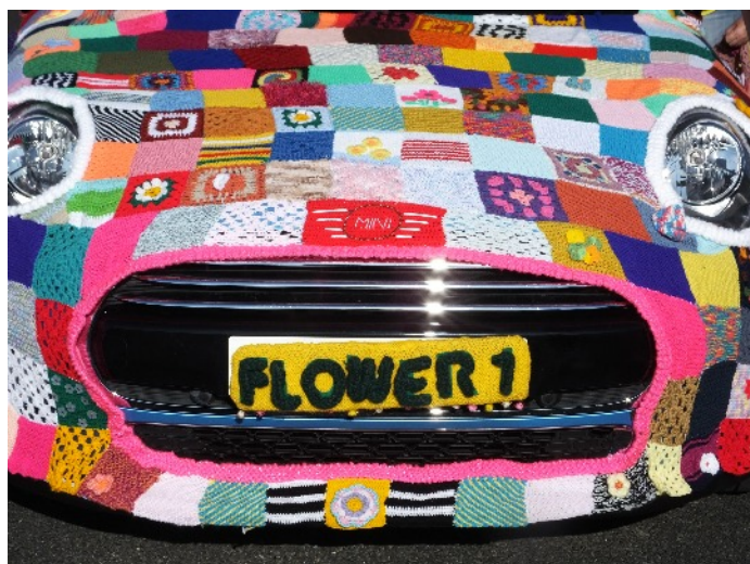
Detail of the hand-knitted and crocheted artwork