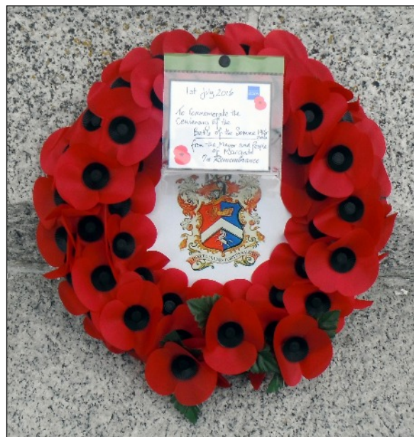
The wreath laid by the Mayor on 1st July 2016 to commemorate the centenary of the Battle of the Somme which started at 7.30am on 1st July 1916