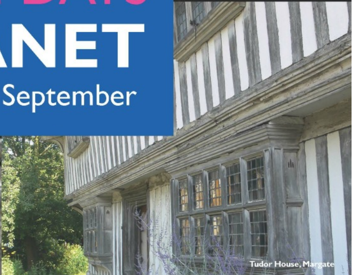
Tudor House, Margate