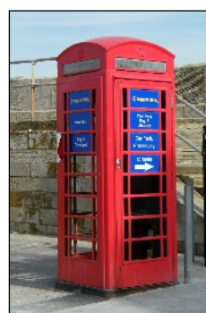
10th April 2011