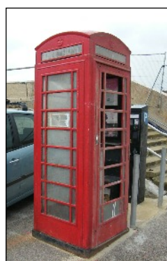
29th August 2010

The three photographs above show the K6 in its original location in Norfolk Road, Cliftonville